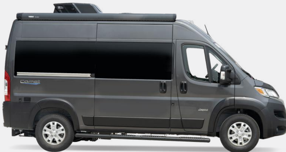
Granite Van (Not Pictured: Silver Van)